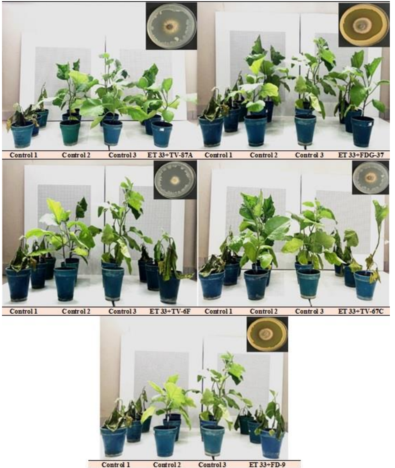
Figure 2. The most effective biocontrol bacterial strains against Botrytis cinerea ET 33 isolate in in vitro and in vivo condition (Control 1: Only pathogen, Control 2: Only biocontrol agent, Control 3: Only NB).

Şekil 2. In vitro ve in vivo şartlarda Botrytis cinerea 'nın ET 33 izolatına karşı en etkili biyoajan bakteri strainleri (Kontrol 1: Sadece patojen, Kontrol 2: Sadece biyoajan bakteri, Kontrol 3: Sadece NB).