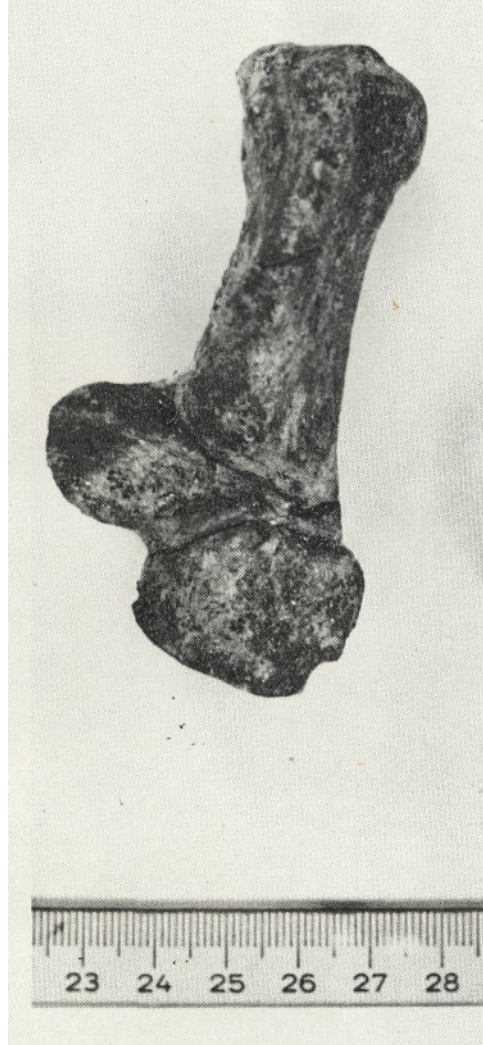
Fig. 1 - Calcaneus of Hyaena eximia , inner view.