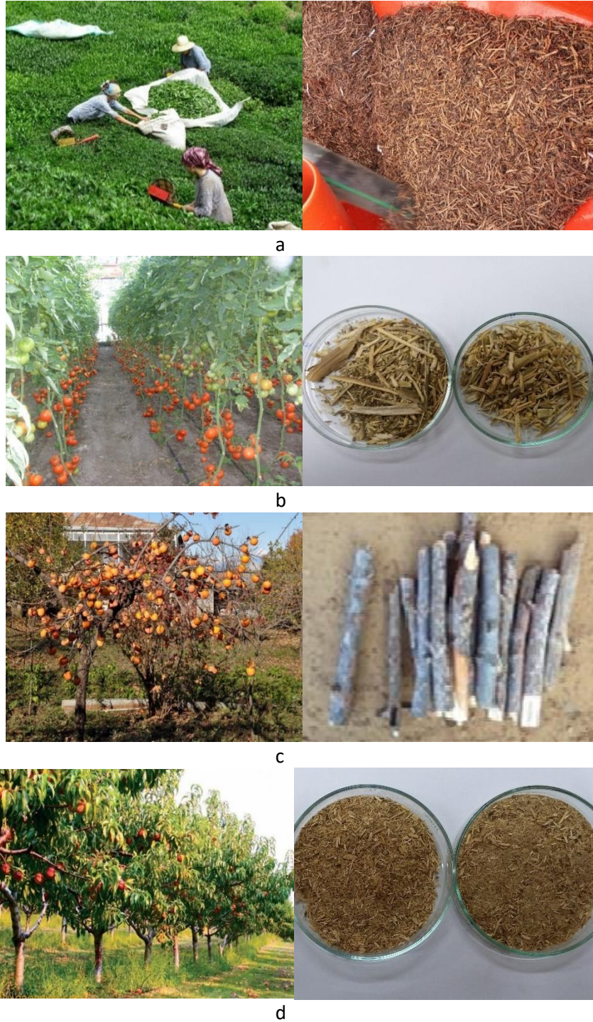
Figure 1. Residues from a) tea, b) tomato, c) persimmon, d) peach

The issue of energy utilization of waste material is a subject of the International and European policy in the field of waste management (Malatak and Bradna, 2017). Biomass has received tremendous attention both in developed and developing countries as a renewable energy source (Grover and Mishra, 1996; Muazu and Stegemann, 2015; Karaca, 2019). Biomass energy, i.e. energy obtained from plant and animal-based natural