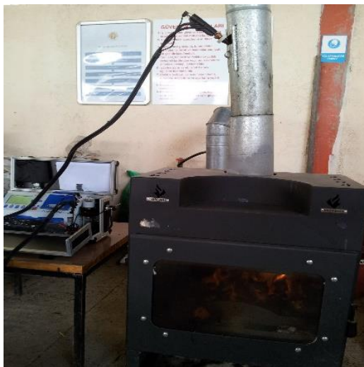
Figure 3. Flue gas emission readings

Data analysis was performed using the IBM SPSS Statistics 21 software. The normality analysis was performed with the Kolmogorov-Smirnov single sample test and the variance homogeneity was assessed by the Levene test and the variances were homogeneous ( P > 0.05 ), with normal distribution of the data.