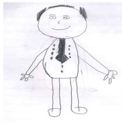
Figure 3a Student Teacher's (BO5) Drawing Figure 3b Fifth-Grade Student's (D6) Drawing