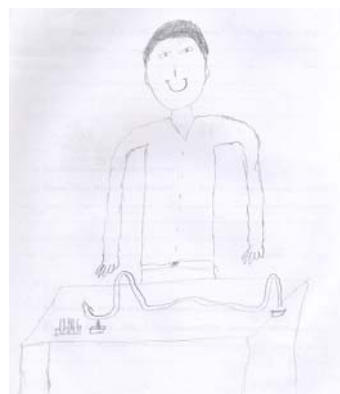
Figure 1b Fifth-Grade Student's (Y12) Drawing