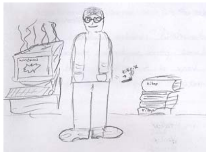
Figure 4 Student Teacher’s (IO7) Drawing

D12- Scientists are working on space...They must be very clever. Scientist always invents new technologies...”