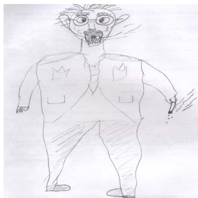
Figure 1a Student Teacher's (BO25) Drawing

Two typical examples of elementary school students' and university level students' drawings for "appearance of scientists" are represented in Figure 1a and Figure 1b. While the student teachers drew a scientist with beard and moustache and a disheveled look, fifth grade students drew a happy scientist with an ordinary appearance.