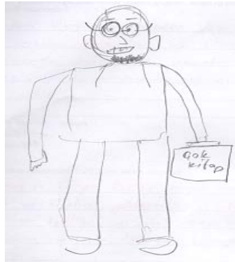
Figure 5 Student Teacher’s (IO9) Drawing

What is more, student IO9’s drawing (see Figure 5) was also consistent with his/her writing. His/her perception of a scientist was stereotypical.