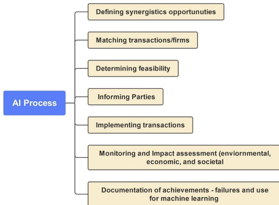
Figure 2. AI process for CE

The use of AI in the transition to a CE requires a systematisation. This systematic approach, which is mainly based on the identification of possible exchange relationships between production/consumption units in a given region, is shown in the figure below.