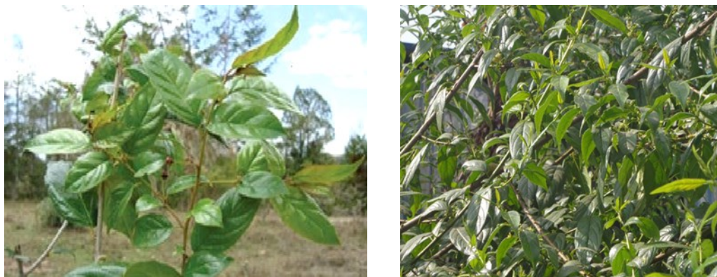
Figure 1. Photo of Rhamnus prinoides (Amabye, 2015; Molla, 2015, respectively).

The decoction of the leaves is recommended as a remedy for treatment of a variety of diseases such as back pain, malaria, pneumonia, sexually transmitted disease, skin infections, wounds, blood purifiers, water borne diseases and as ethnoveterinary medicine (Berhanu, 2014; Enyew et al., 2014; Fratkin, 1996; Megersa et al., 2013; Muthee et al., 2011; Njoroge & Bussmann, 2006; Prozesky et al., 2001; Sobiecki, 2002). The leaves are mainly used in traditional medicine followed by roots (Araya et al., 2015; Diallo et al., 2002; Giday et al., 2010; Seid & Aydagnehum, 2013). Various classes of secondary metabolites such as flavonoids, alkaloids, tannins, terpenoids, saponins, steroids and anthraquinones have been reported from the genus of which polyphenols were abundant with tremendous antioxidant and anti-inflammatory activities (Chen et al., 2020). The plant also serves as an important hopping agent, making traditional alcoholic beverages like tella and tej (in Ethiopia), animal feed, medicine, nectar for bees, soil conservation, ornamental, shade and dyes in textiles. This review presents a comprehensive overview of the chemical profile as well as biological activities of the plant underlining remarkable activities demonstrated by various parts of the plant supporting its potential use as an alternative medicine for future healthcare practice.