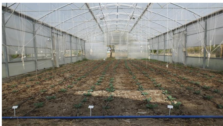
Figure 1. Appearance of broccoli plants planted in the experimental greenhouse.

This study was conducted in a plastic greenhouse (270 m 2 ) belonging to the Faculty of Agriculture of Malatya Turgut Özal University between October/March 2020-2021 (Figure 1).