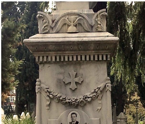
F.12: Scarpello Family tomb, Hourglass with wings, acanthus leaves, dentil molding, and garland of flowers