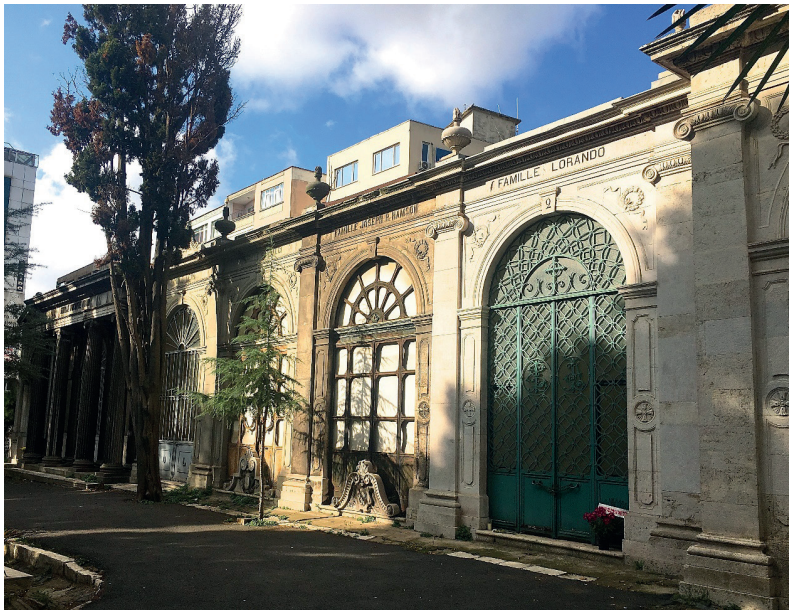
F.22: Funerary chapels