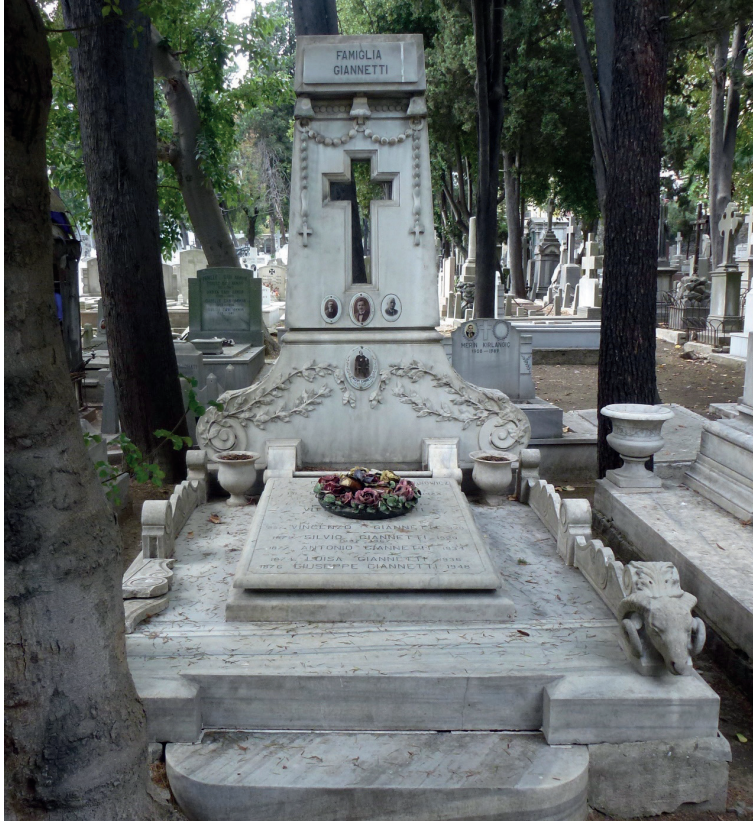
F.9: Gianetti Family tomb

The Gianetti Family tomb is also a marble pillar with a Latin cross carved at the center and the relief of a hanging rosary with two small crosses. The pillar is mounted over a base with volutes and reliefs of laurel branches. The burial area is defined by a marble surround with two ram's heads placed at the front ends. The heads are adorned with acanthus leaves. The ram's head is used in Neoclassical decoration, making reference to sacrificial rites and rituals. 21 (F. 9: Gianetti Family tomb, F.10: The base and ram's head with acanthus leaves)