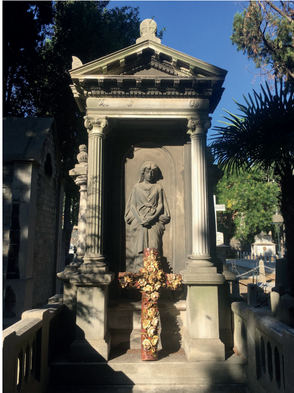
F.15: The Rizzo Family tomb - aedicula

The Welter aedicula is in white marble and has a triangular pediment with an imposing palmette placed at the apex. The eave is lined with a frieze of acanthus leaves and the tympanum with a row of dentil molding. The name of the family is inscribed on the architrave that is supported by two fluted columns with Corinthian capitals. The burial area is covered by a lid that has the relief of a Latin cross decorated by acanthus leaves (F.15: The Rizzo Family tomb - aedicula ) (F.16-17: Welter Family tomb - aedicula ).