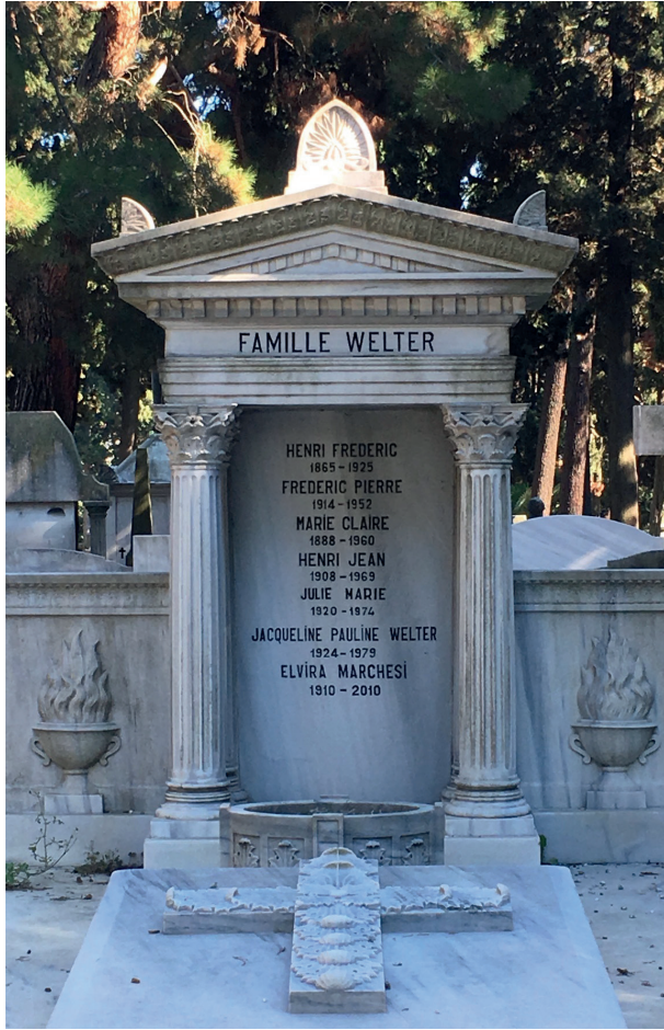
F.16: Welter Family tomb – aedicula