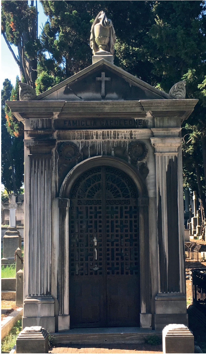
F.18: Capoleone Mausoleum

Another mausoleum designed as a Greek temple is built in white marble for the Mratovich Family. There is a triangular pediment and the entablature is composed of a series of triglyphs and metopes supported by two pilasters. The name of the family is inscribed on a plaque mounted on the architrave and the door is flanked by two half columns ( F. 19: Mratovich Mausoleum).