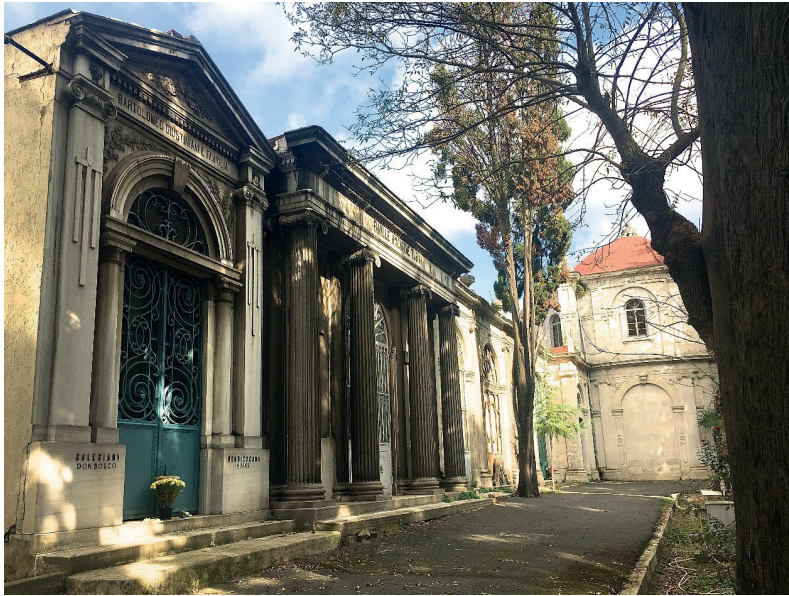
F.21: Funerary chapels

the entablature. The columns have square bases, hence making reference to antique Roman (F. 23: Tubini Chapel)