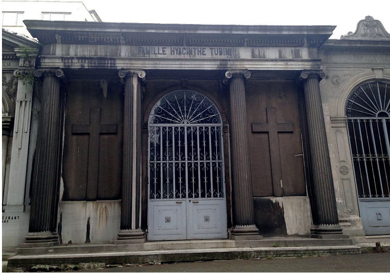
F. 23: Tubini Chapel

The Corpi Family chapel is more elaborate and designed in white marble with exquisite ornaments and details. The acroter is a draped angel with the head missing and is mounted over a decorative element composed of a floral garland, rosettes, volutes and acanthus leaves. Four urns are placed on both sides of the acroter, one pair on each side. The entablature is lined with a row of egg-and-dart molding. The name of the family is written with relief letters on the architrave that displays symmetrical decorations of rosettes and acanthus leaves enclosed in heart forms. The façade is partitioned into three sections by four ionic capital pilasters. The door is set under a curved arch at the center and an angel's head with wings is placed as the keystone. The two sections on both sides of the door have a niche under a curved arch adorned with olive branches and torches tied with ribbons. The angel's head with wings is repeated as the keystone on both niches. A statue of a female figure draped in a cloak is placed in each niche, but the heads are missing. The figure on the right is holding a rope tied to an anchor and the one on the left is holding a bunch of flowers (probably what is left of a broken wreath) and there is a cross and a scroll beside the feet. Both statues are placed on plinths that are decorated by a relief composition of a laurel wreath, ribbon, and two inverted torches crossing diagonally. (F. 24-25: The Funerary Chapel of the Corpi Family)