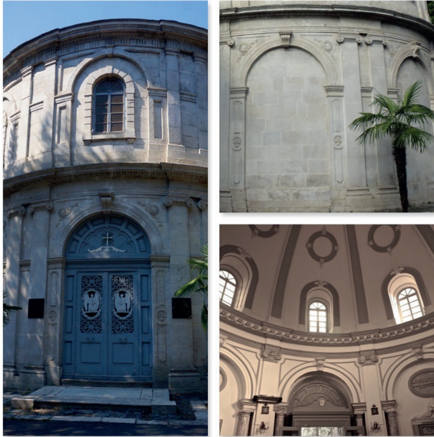
F.1: The Chapel at the Feriköy Latin Catholic Cemetery, Neoclassical details outside the Chapel and the interior

The construction of the funerary chapel started in 1863. The chapel, attached to the western wall of the cemetery, was designed by Abbot Giorgiovich, a former pupil for the Propaganda in Rome. He had conceived the plan of the building and supervised the interior decoration and ornamentation. Due to budgetary constraints, construction could only be completed in 1872. 14 (F.1: The Chapel at the Feriköy Latin Catholic Cemetery)