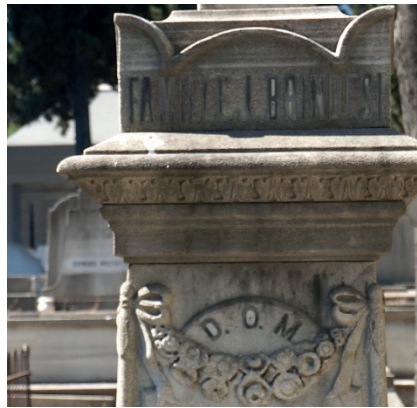
F.3: Acanthus leaves and garland of flowers