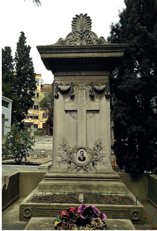
F.7: Antoine Collaro tomb

a large Latin cross with palmettes and Neoclassical motifs is displayed on the pillar. At the base of the cross, an arrangement of olive branches tied with a ribbon frames a photograph. ( F.7: Antoine Collaro tomb, F.8: Acroter with Neoclassical details)