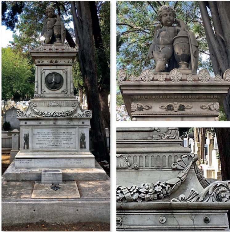
F.13: Adelaie-Sassiae-Longobardae Families

The profusely ornate tomb of the Adelaie-Sassiae-Longobardae 23 families is quite impressive with the child angel ( putto ) leaning on a draped urn and lavish decorations on the stepped monument. The upper edge displays a row of alternating large and small palmettes. The cornice is lined with egg-and-dart molding and there is a frieze with flowers and acanthus leaves. An inverted dove holding a small wreath in its beak is placed inside a circle formed by a snake biting its own end, which is another funerary symbol representing eternal renaissance, perpetual transformation between life and death. The snake's shedding its skin also makes reference to rebirth and renewal. 24 The base of the tomb has a relief of a garland of flowers with floral rosettes and acanthus leaves at the corners. The child angel, palmettes, egg-and-dart-molding, acanthus leaves, and garlands are elements making reference to the Neoclassical style in this tomb. (F. 13: The tomb of Adelaie-Sassiae-Longobardae families)