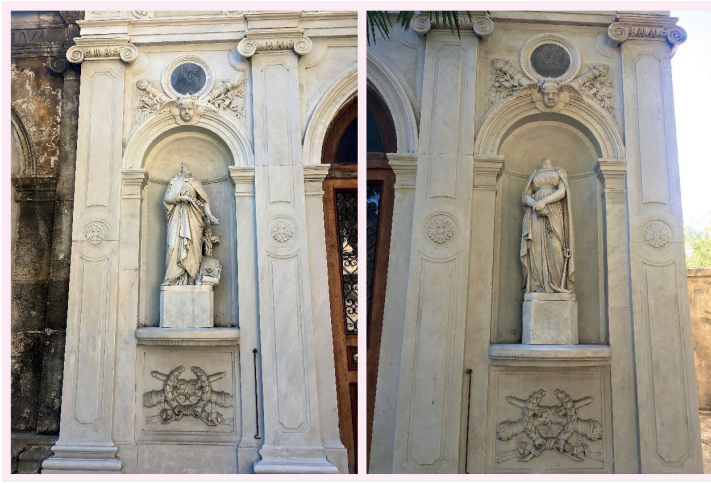
F. 25: Corpi family Chapel, details