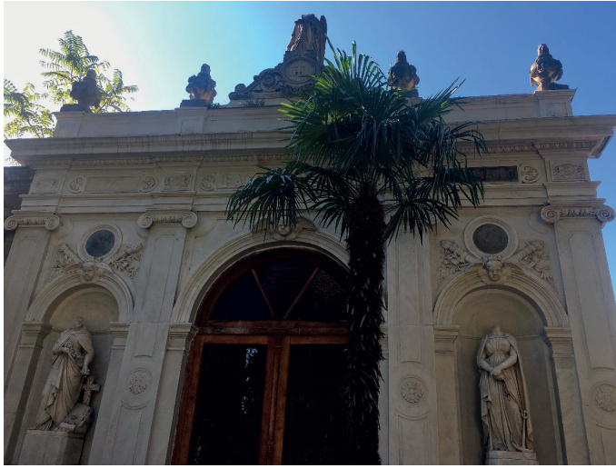
F. 24: The Funerary Chapel of the Corpi Family