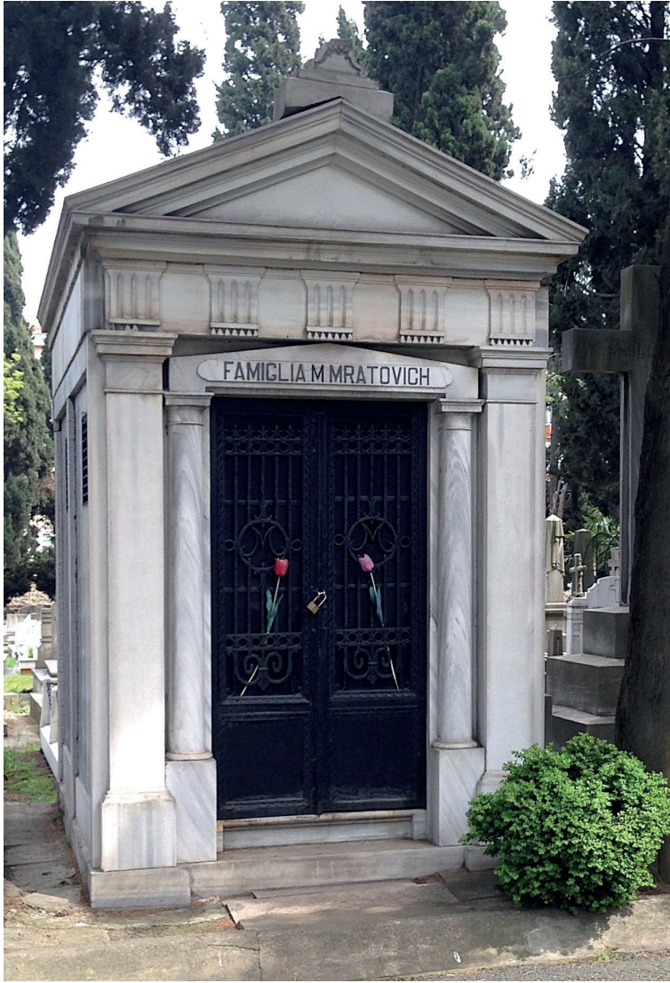
F.19: Mratovich Mausoleum

The tympanum of the Medovich Mausoleum is lined with dentil molding and there is a relief of a cross on the tympanum. The pediment is supported by a pair of dosserets and fluted columns flanking the door to the burial chamber. The stonework in white marble makes reference to the Renaissance style. ( F. 20: Medovich Mausoleum)