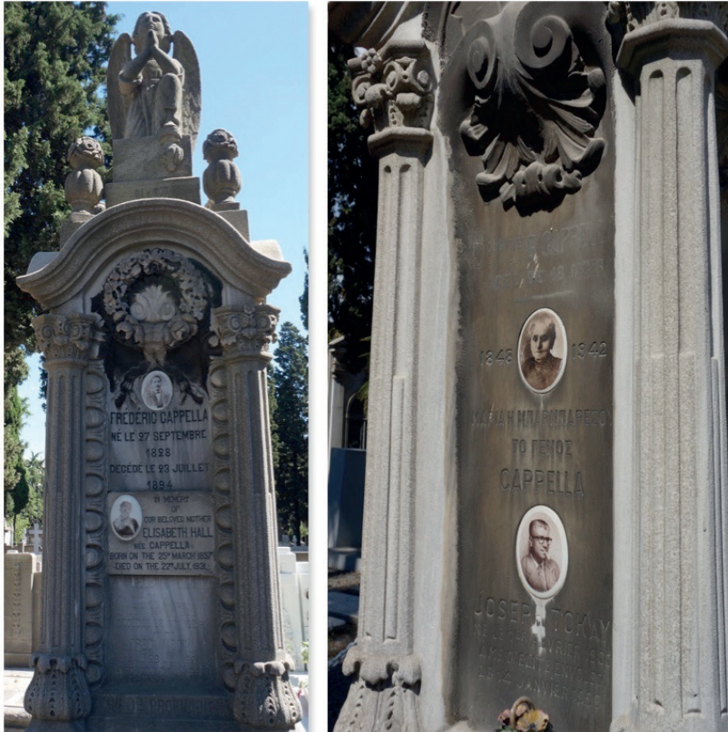
F.5: Cappella Family tomb, Neoclassical details

The Cappella tomb is a very ornate structure profusely adorned with symbols and decorations. There is a kneeling angel with wings mounted on a pillar with curved pediments. A floral wreath tied with a ribbon is displayed under the curve of the pediment and there is a palmette with volutes at the center of the wreath. Two fluted half columns with composite capitals rise on both sides of the pillar and vertical rows of egg-and-dart molding line the inner edges of the half columns. The bases of the columns are adorned with acanthus leaves and the base of the pillar has similar decorations with acanthus leaves and floral compositions. The Cappella tomb also displays Neoclassical elements, such as the wreath, palmette, composite capitals, acanthus leaves, and egg-and-dart molding. (F.5: Cappella Family tomb)