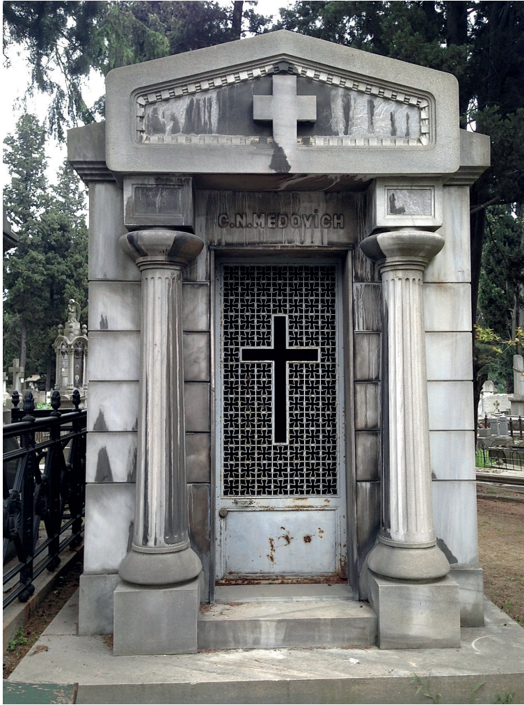
F. 20: Medovich Mausoleum

The northwest wall of the cemetery is lined with monumental funerary chapels belonging to prominent Levantine families of Istanbul ( F.21, F.22 ). Designed as a prostylos temple, the Tubini Family chapel is a rectangular structure with symmetrical layout. The entablature is composed of a series of friezes: there are rows of egg-and-dart and dentil molding and acanthus leaves. The name of the family is marked on the architrave with relief letters and there is another frieze of acanthus leaves underneath. The façade is partitioned into three sections by pilasters and the door is set at the center under a curved arch with a keystone. There are reliefs of two large Latin crosses on both sides of the door. The symmetrical scheme of the structure is repeated in the front and there are four fluted columns with ionic capitals supporting