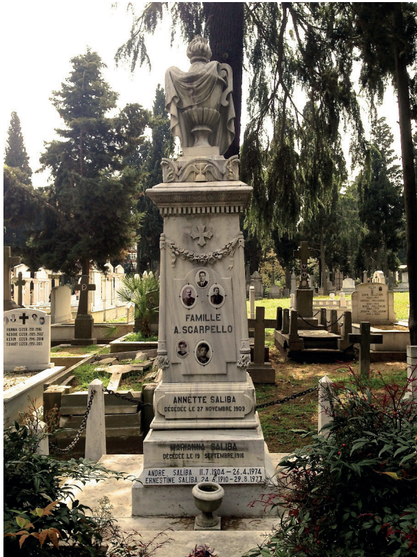
F.11: Scarpello Family tomb