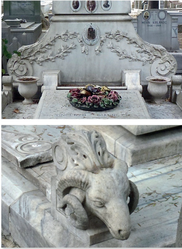
F.10: Gianetti Family tomb, Base with volutes and laurel leaves, ram's head with acanthus leaves

An urn draped in a shroud is mounted over a pillar at the Scarpello tomb that is designed in marble. The curved pediment has the relief of an hourglass with wings that denotes time or life flying away. 22 The horns at the corners are decorated with acanthus leaves and the cornice under the pediment is lined with a frieze of acanthus leaves and dentil molding. A garland of flowers adorns the pillar and the ends of the garland are tied to inverted torches with ribbons. Besides Neoclassical elements, the Scarpello tomb is replete in funerary symbols as well. ( F.11: Scarpello Family tomb, F.12: Neoclassical details)