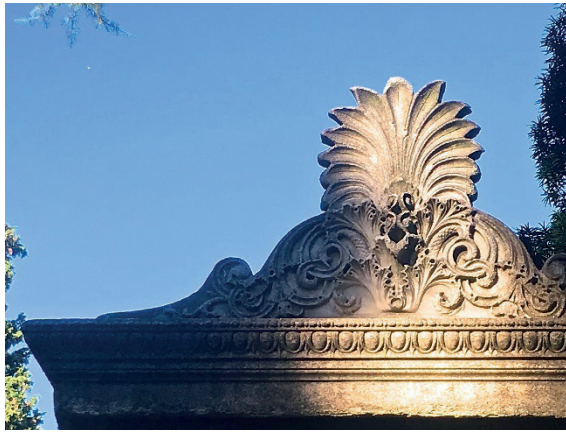
F.8: Antoine Collaro tomb, acroter with palmette and acanthus leaves