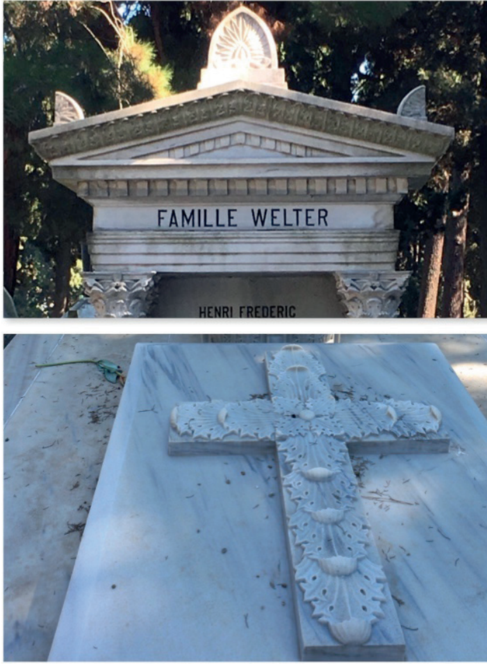
F.17: Welter tomb, details