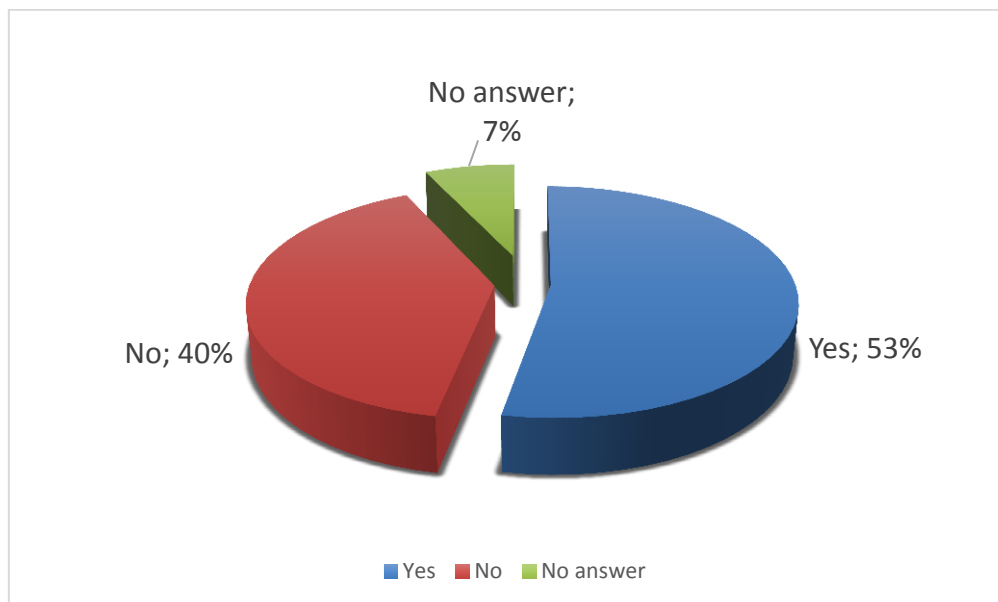
Figure 2. Can you still use the ICT skills that you learned from your study?

As the results show, using PhenoBL can improve the students' understanding, and engagement of the taught subject increases thus improves their learning capabilities and skills. This fact is also supported in previous researches done in this area (Francis et al., 2013; Symeonidis & Schwarz, 2016; Valanne et al., 2017). After the exams, we had an interview with participated students in and asked them about whether they still can use the skills that they learned in the ICT while studying. The answers are shown in Figure 2.