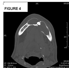
Figure 4: CT axial view showing the extent of the lesion with the evidence of an impacted tooth and perforation of lingual cortical plate

Panoramic radiograph revealed well defined hazy radiolucent lesion involving the lower jaw (figure 4). Margins appear to be smooth, regular and non-corticated. Superior aspect of the lesion has a scalloped margin. The lesion extends from the distal aspect of 37, grows anteroposteriorly, and crosses the midline and reach till the distal aspect of 45. Displacement of teeth and resorption of roots of the teeth are evident. Presence of multiple septae within the radiolucent lesion gives a multilocular appearance. Also there is presence of tooth like radiopacity suggestive of an impacted tooth within the lesion, near the inferior border of the mandible, which is intact.