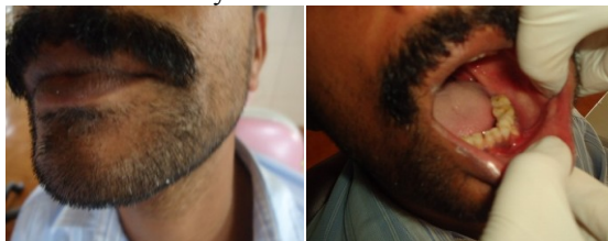
Figure 1. Asymptomatic swelling in the left mandible Figure 2: Obliteration of left buccal vestibule

A 45 year old male visited the department of Oral Medicine and Radiology, Yenepoya Dental College, Yenepoya University, Mangalore with a complaint of asymptomatic swelling in the left lower jaw since 1 month. He noticed the swelling one month back which gradually increased to the present size. Swelling began following a tooth ache and was associated with throbbing type of pain which aggravates upon touch and mastication. His medical and family history was noncontributory. Extra oral examination revealed presence of diffuse swelling over left lower jaw (figure 1) measuring approximately 4×3 cm in size, extending inferiorly 0.5 cm below the inferior border of mandible. Swelling was non fluctuant, non-compressible and hard in consistency.