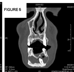
Figure 5: CT coronal view of the extensive lesion showing superoinferior extension

Computed tomographic (CT) axial view showed a well-defined hypodense area involving the mandible with its buccolingual and anteroposterior extension (figure 5) crossing the midline. Buccal cortical plates appear to be intact but there is perforation of lingual cortical plate on the left side of the jaw. There is also an evidence of hyperdense structure in the centre suggestive of an impacted tooth. Similarly, coronal (figure 6) and sagittal views showed the superoinferior and anteroposterior extension of the hypodense lesion (figure 7A & 7B).