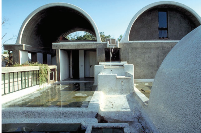
Figure 14. Architect’s Office (Sangath), Balkrishna Doshi. Ahmedabad, India, 1979-1981. View from the pools and the pavilions.

his preference for imitation in his own office complex in Ahmedabad (“Sangath”, 1981) inclined equally towards the trabeated mandapa and barrel-vaulted chaitya , where the historical replacement of wood by stone proves the existence of a deeply rooted culture of imitation continued by Doshi with the new material (Figure 14).