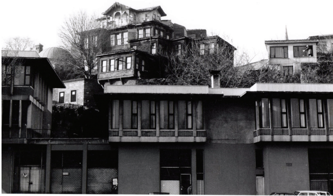
Figure 3. Social Security Complex, Sedat Hakki Eldem. Istanbul, Turkey, 1962-1964. View from the South-East.

While the reinforced concrete structure and plastered brick walls helped Eldem to reduce the construction details to the minimum, like in the experiments of Perret (with whom Eldem was acquainted in Paris 22 ), the rhythm of the reinforced concrete elements helped him invoke an abstract image of the collective memory, the “Turkish House”. Eventually, with the help of concrete, Eldem could achieve the dream of the post-colonial architect: a critical, regional, popular, and yet Modern architecture.