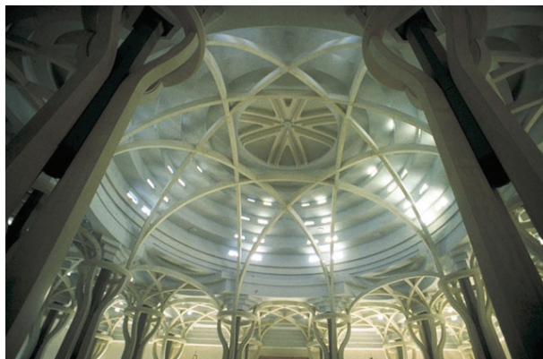
Figure 13. Centro Islamico Culturale d'Italia (CICI), Mousawi and Paolo Portoghesi. Rome, Italy, 1983-1995. View from the prayer hall.