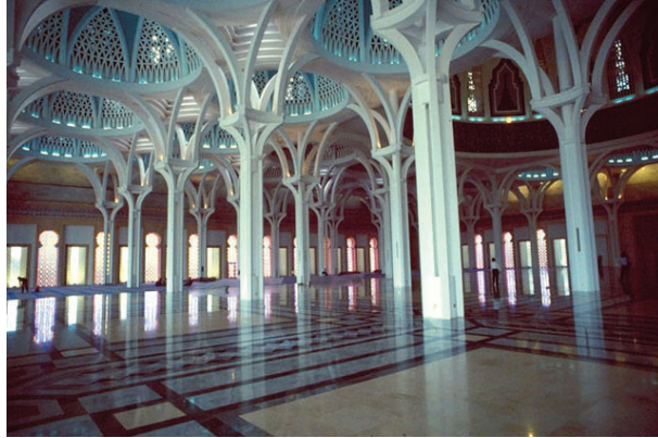
Fig. 12. Sarawak State Mosque, Sami Mousawi. Sarawak, Malaysia, 1990. View from the interior. https://archnet.org/media_contents/13469

with the firm of Paolo Portoghesi in Rome, the Centro Islamico Culturale d'Italia, completed in 1995 (Figure 13). Here, references to the earlier hypostyle mosques and the later central-spaced mosques expand the conception of "Islamic architecture", which never had a single line of stylistic development. Most importantly, ornamentation, an essential element for cultural signification, was not superposed on the structure but made an integral part of it, adding to the effect of lightness and dematerialisation created by the white-washed embroidery-like elements. 38