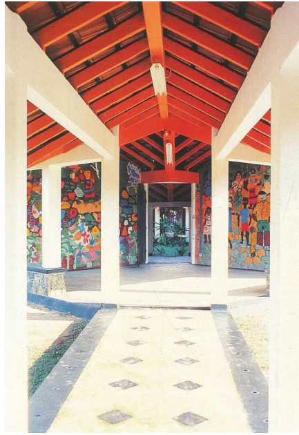
Figure 9. Hermann-Gmeiner School (SOS Youth Village), C. Anjalendran.

Piliyandala, Sri Lanka, 1983-1985. General view (Anjalendran, 1986, p. 31).