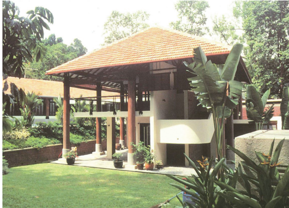
Figure 10. Reuter's House, William Lim Associates. Singapore, 1990 (Lim, 1991, p. 40).

vious examples above, this building suggests that concrete can veil its material substance, has a potential for dematerialisation, and can become subservient in heterogeneous contexts. With the giant order of independent pilotis behind which the white slabs advance and recede, this residential complex seems to invert Le Corbusier's "free plan" (Figure 10). Therefore, imagined as a "three-dimensional collage", this building demonstrates a unique interpretation of regionalism in concrete by prohibiting this modern material in traditional expressions, which is to be imitated only by traditional materials. This situation, which is a paradox in terms of the rationale of Modernism, is justified as a "juxtaposed contradiction" of the Postmodern discourse. 34