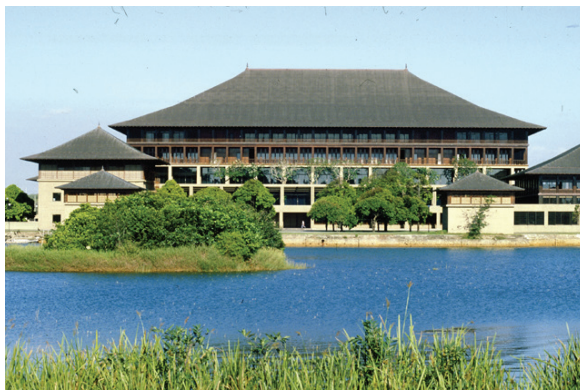
Figure 7. New Parliamentary Complex, Geoffrey Bawa. Kotte, Sri Lanka, 1979-1982.

In Kandyan Art Association Centenary Cultural Centre, built in 1984 in Kandy, Sri Lanka, which was designed as workshops and exhibition spaces for local crafts, the architect Minette De Silva combined traditional and modern ma-