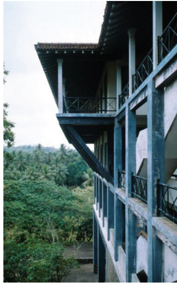
Figure 6. Arts and Sciences Faculties of the University of Ruhuna, Geoffrey Bawa. Matara, Sri Lanka, 1980-1988.