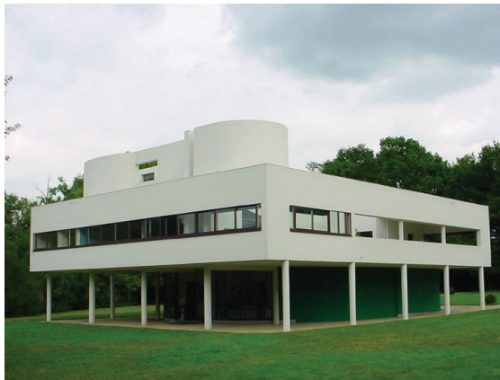
Figure 2. Villa Savoye, Le Corbusier. Poissy-sur-Seine, France, 1929-1931. Main façade.